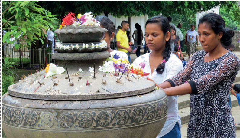
RENOUNCING FALSE WITNESS

Christian Witness in a Multi-Religious World, Principle 9