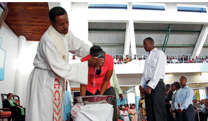
ENSURING PERSONAL DISCERNMENT

Christian Witness in a Multi-Religious World, Principle 10