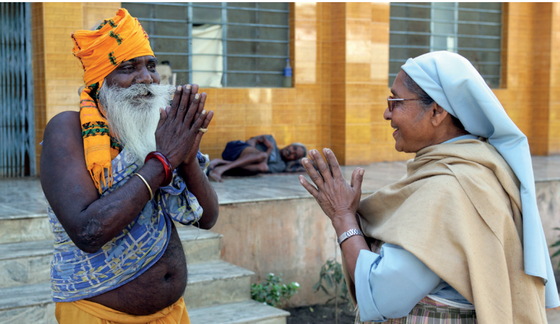
RESPECT FOR ALL PEOPLE