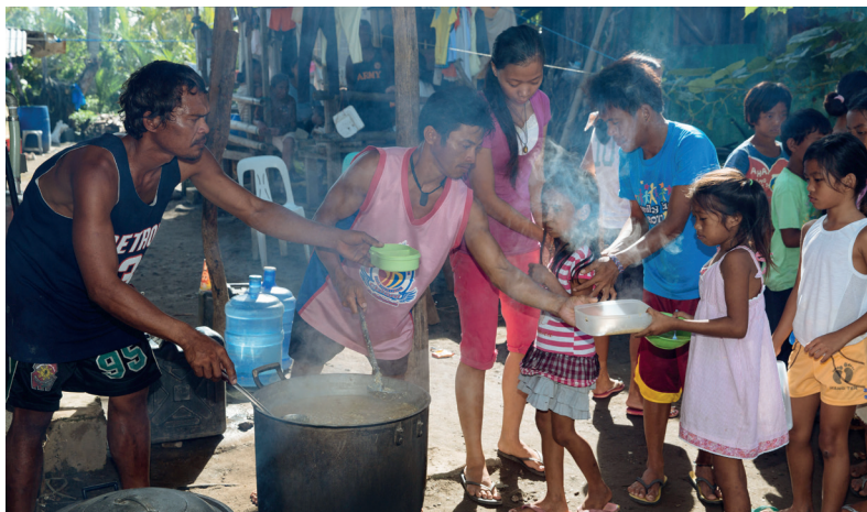
IMITATING JESUS CHRIST