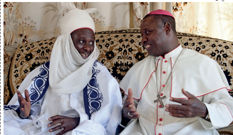
BUILDING INTERRELIGIOUS RELATIONSHIPS

Christian Witness in a Multi-Religious World, Principle 11, Photo: Peter Jonas