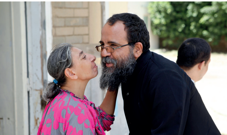
ACTING IN GOD'S LOVE

Christian Witness in a Multi-Religious World, Principle 2, Photo: Harmut Schwarzbach